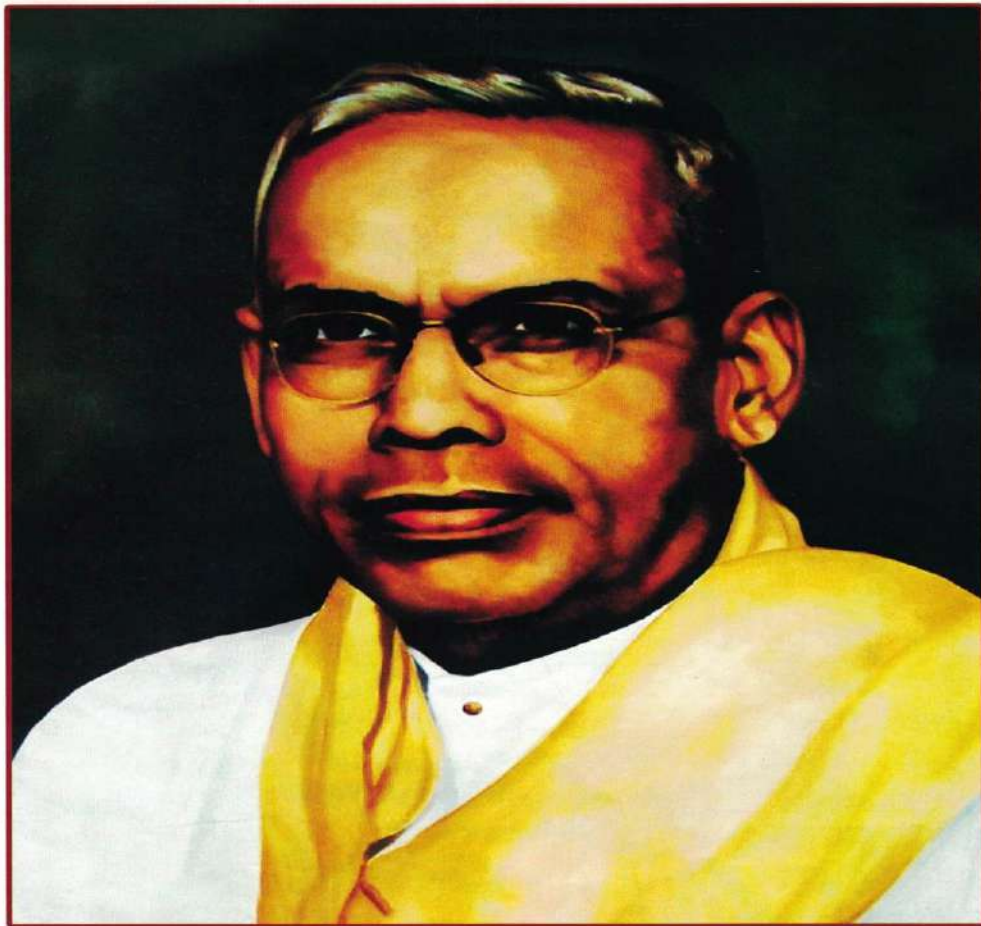
Dr. Shiyali Ramamrita Ranganathan 'The Father of Library Science in India'