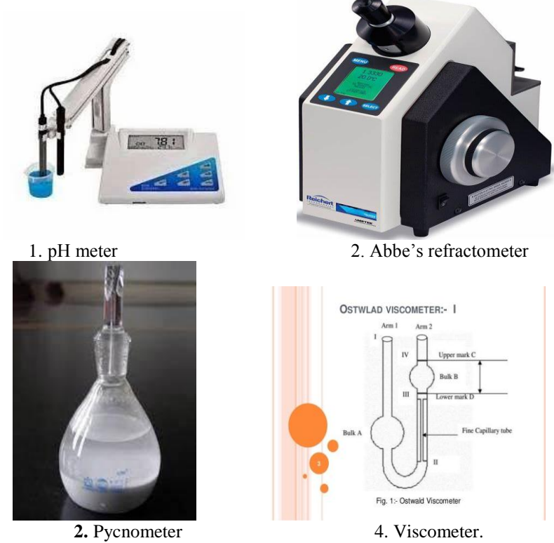
Figure no. 02. Instruments used for testing different Analytical parameters.