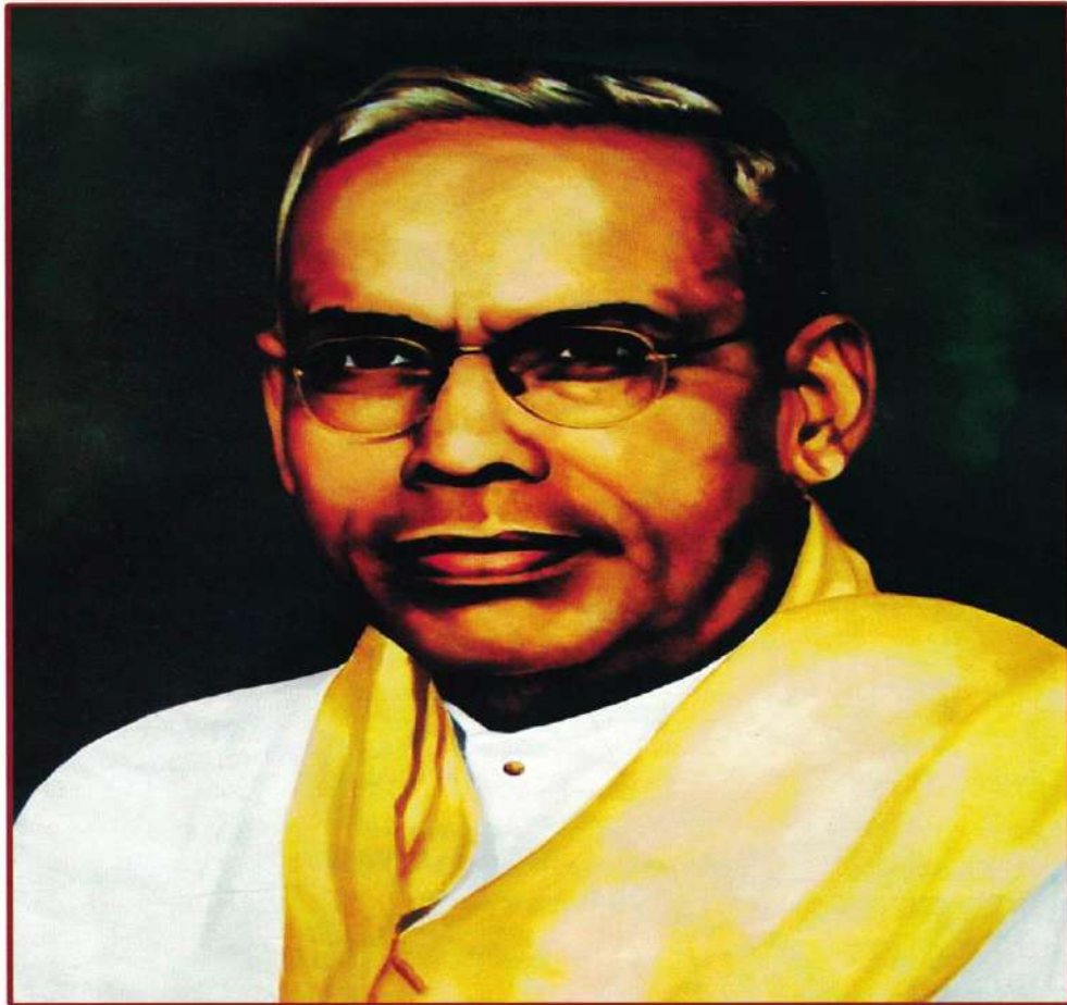
Dr. Shiyali Ramamrita Ranganathan 'The Father of Library Science in India'